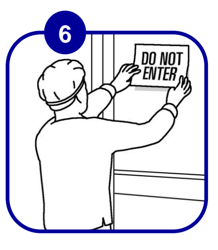
Close the door to the room – Post a Do Not Enter sign by the door.